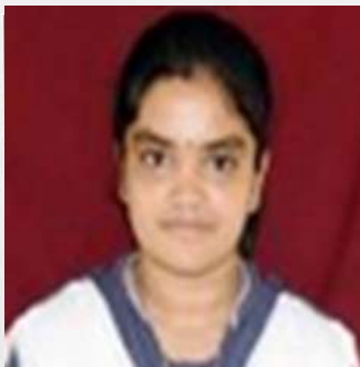
B.V. GEETHIKA CULTURAL CAPTAIN (GIRL)